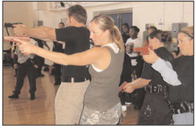
APG Tactical Firearm

The U.S.N.S.T.A. brings together the best trainers from law enforcement, corrections, military, protective services, and security to collaborate on the most current tactical issues facing officers in the development of training that increases officer safety and adds value to an agency's overall training program. The U.S.N.S.T.A. Law Enforcement Training Seminar Series and the U.S.N.S.T.A. National Training Conference provide law enforcement officers and departmental instructors with the opportunity to network with peers, compare notes, share tips, and train in modern techniques that fall within a nationally accepted standard.